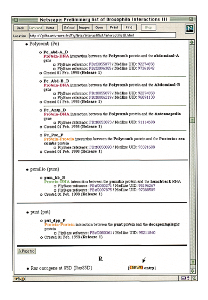
Figure 1. A portion of a page from Flynets-list. All interactions are alphabetically ranked according to the name of the effector. For each interaction the abbreviation, the descriptor and type of the interaction, the bibliographic links in Flybase and Medline and the creation date are given. A color code allows the user to grasp at a glance the molecular type of the interaction (pink: protein–DNA, green: protein–RNA and yellow: protein–protein). New entries in the latest release are flagged by a logo (arrow).

A powerful query search program has now been introduced in FlyNets. It allows searching for the occurrence of an ASCII